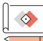
Drawing & Dotting